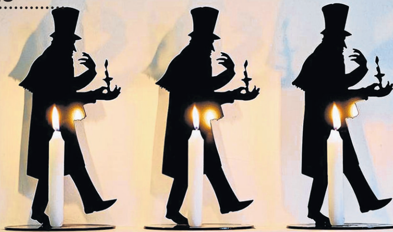
Scrooge Candlestick, limited edition Velvet & Dash design.