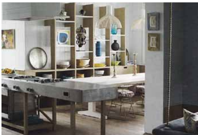
Above: The combination of natural materials like wood with practical steel is softened with decorative objects to create the perfect modern rustic ambiance in this kitchen designed by West Dorset furniture maker James Verner ( jamesverner.co.uk )