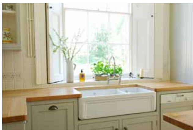
Below: Belfast Kitchen Sink from Shaws of Darwen by Velvet & Dash Interiors.