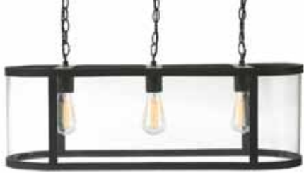
Above: Cadogan 3 Pendant Light by Mobius Living £245 (mobius-living.co.uk)