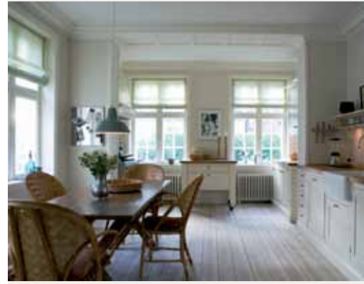
Above: Modern rustic colours by Farrow & Ball Wall: Slipper Satin; Skirting Board: Pointing; Cabinets: Lime White