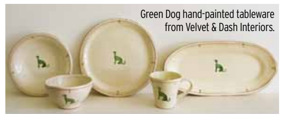
Green Dog hand-painted tableware from Velvet & Dash Interiors.