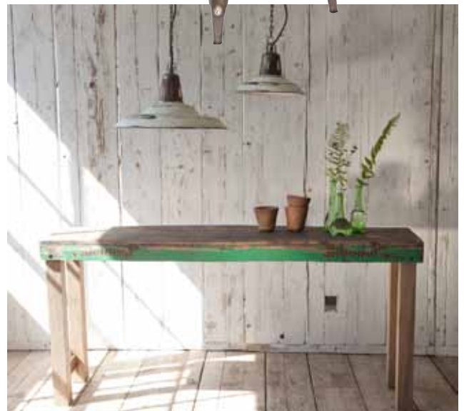
Right: Urban Pendant Light by Alexander & Pearl £129.95 (alexanderandpearl.co.uk)