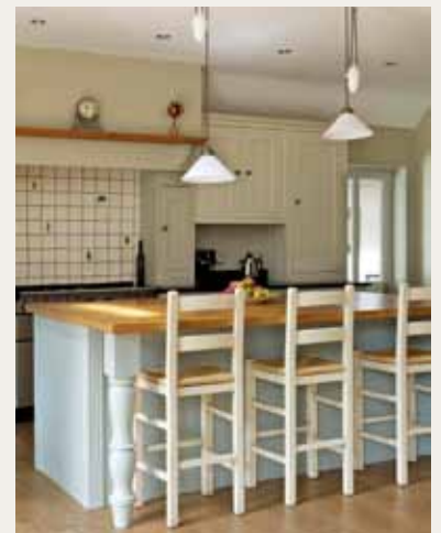
Kitchen in F & B Wimborne White and Clunch