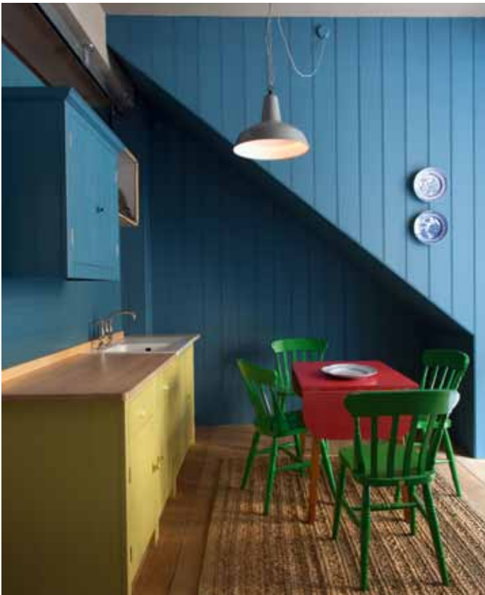
Above: British Standard Kitchen Cupboards. Prices for cupboards start from £300; kitchens start from £5,000 Contact: 020 7870 7688 (britishstandardcupboards.co.uk)