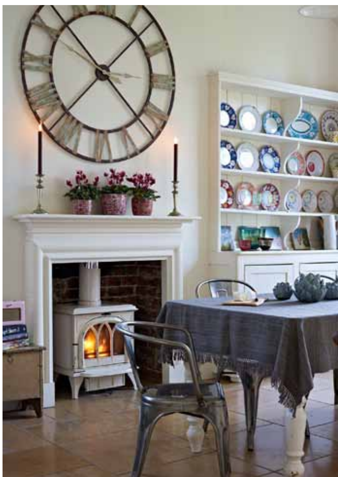
Above and left: Breakfast room dresser with plates by Velvet & Dash Interiors